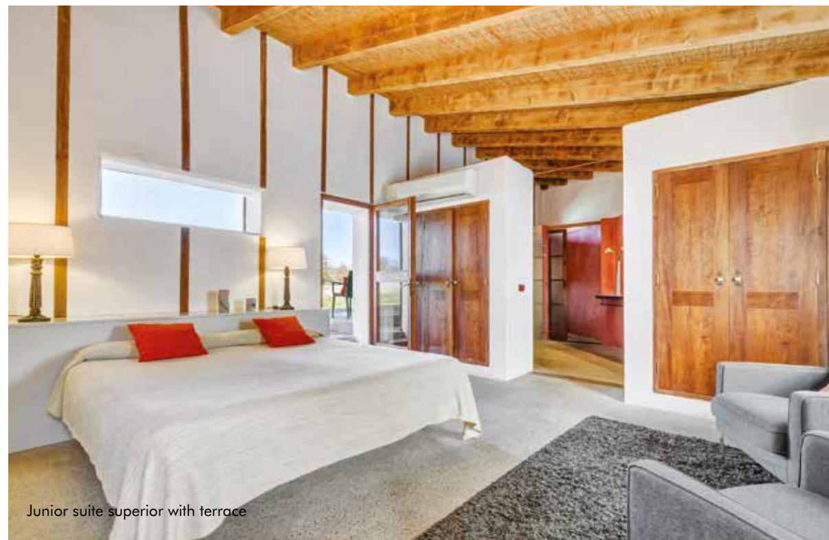
Junior suite superior with terrace