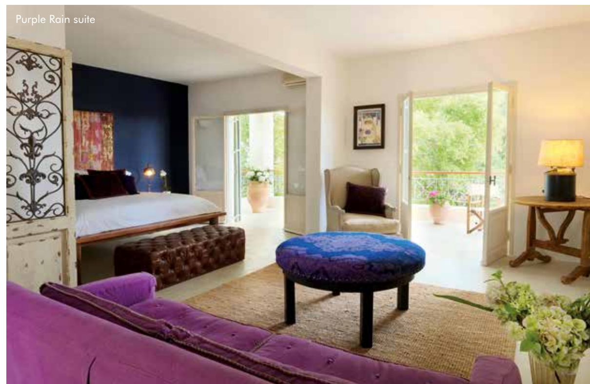
Purple Rain suite

“We have travelled far and wide with Simpson Travel and I can only say we have found the Jewel in the Crown. The Purple Apricot is a haven of peace and tranquillity.”