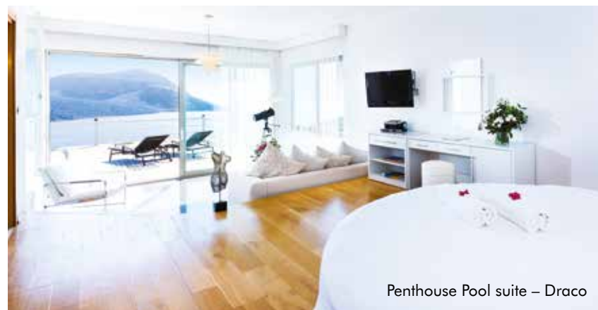
Penthouse Pool suite – Draco