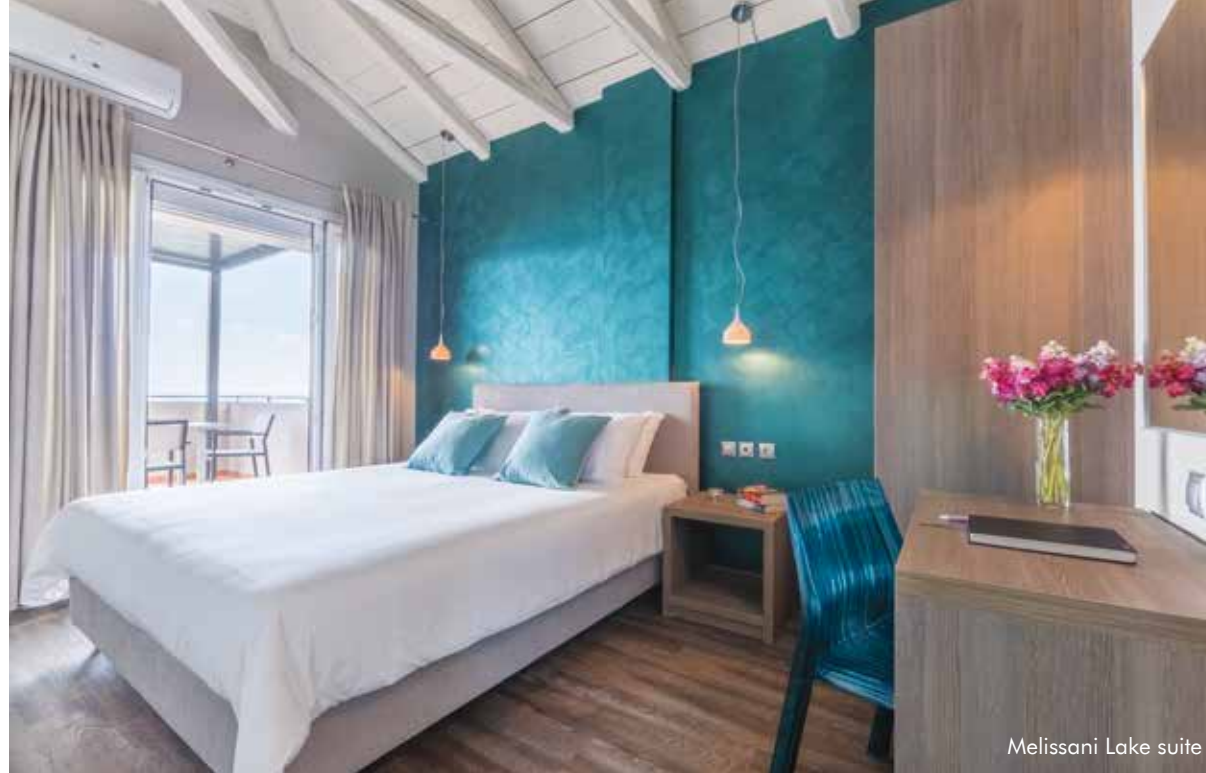
Melissani Lake suite

*Children are welcome from 21 July – 1 September. All other departure dates are Adult Only (18 and over).