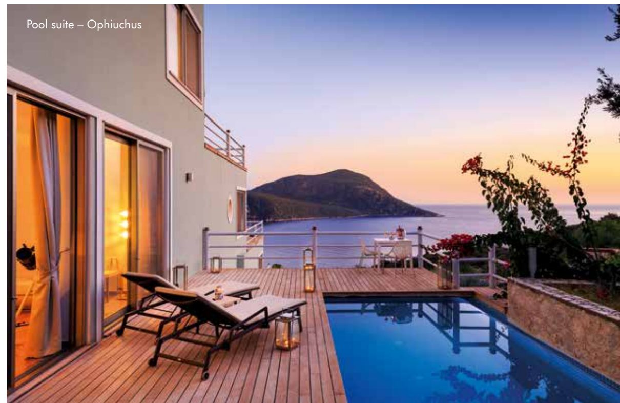
Pool suite – Ophiuchus

“An absolute gem of a hotel, I can't recommend it more highly — or its excellent staff and service. Perfect, secluded location, but within an easy walk of the town and harbour.” LH, 2017