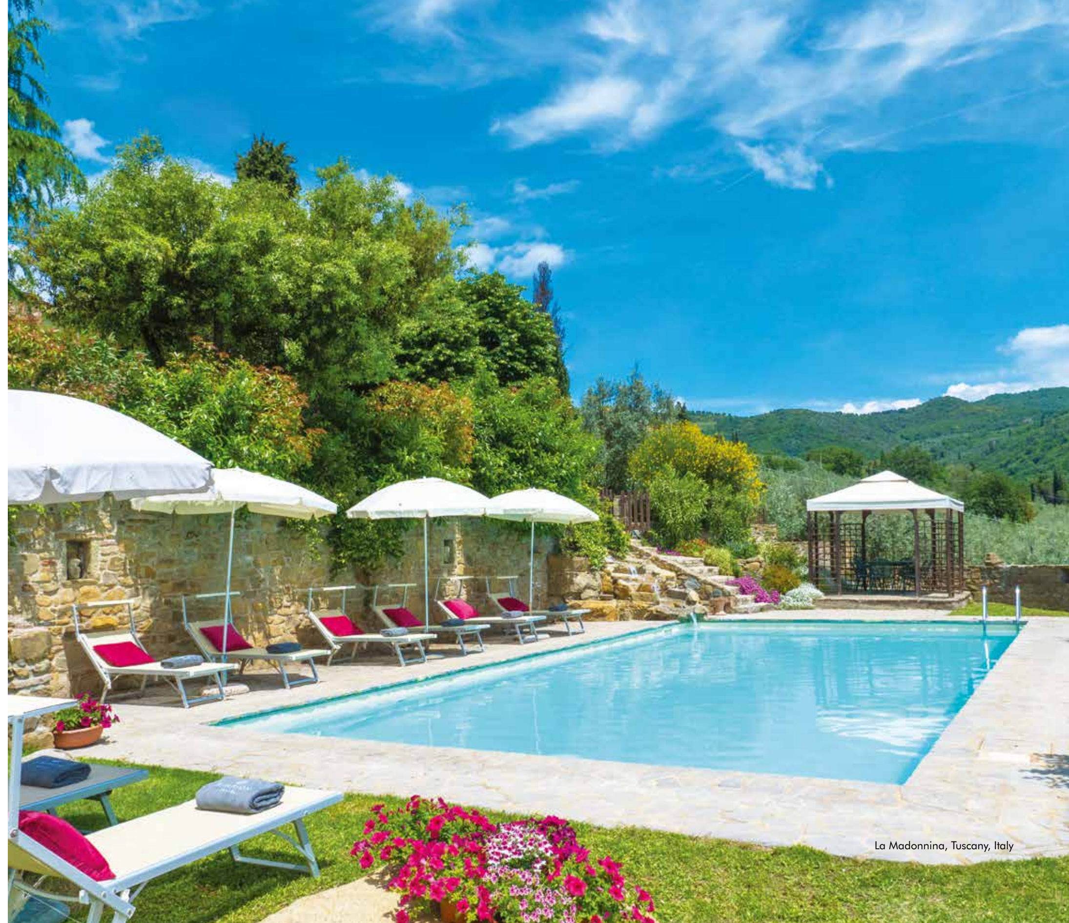
La Madonnina, Tuscany, Italy

From the welcome bottle of wine on arrival to the cool cotton bedlinen and beds individually tested for comfort, we never compromise on the essentials of a deeply restful stay. And we believe that every day deserves to begin with a delicious breakfast, homecooked and bursting with fresh, local ingredients.